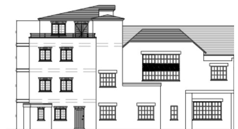
Side view of the new building with the existing Parish centre on the right

For the amount we have, we can build the shell of the accommodation block. The building will be sealed and weatherproof, with all windows and doors in place, but it won't be ready for its new inhabitants just yet. The Parish rooms will be left in their current condition until we can afford to finish the work. So how much will it cost to finish it all off?