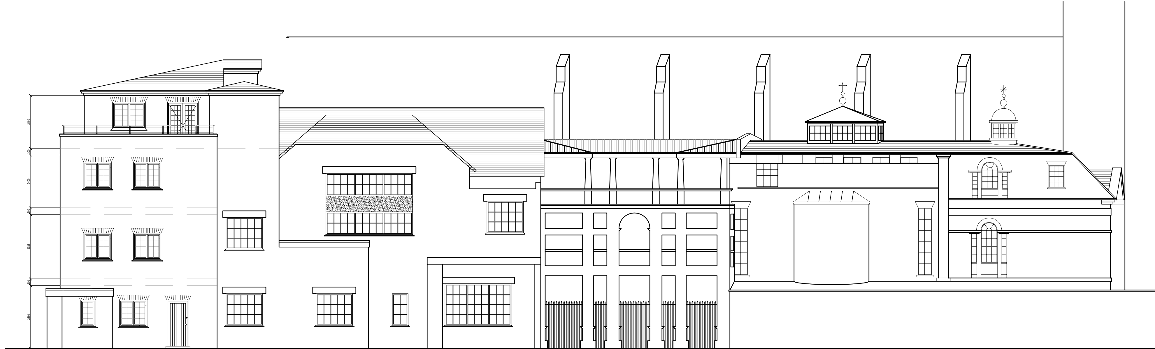
PROPOSED ELEVATION A (SCALE 1:100)